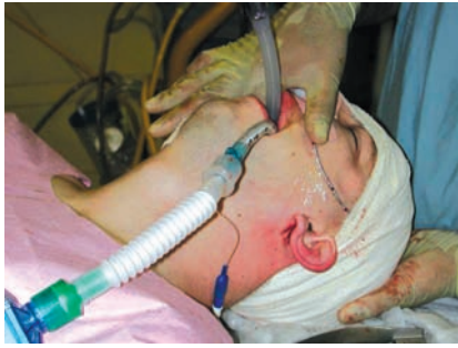
Figure 1. Bailey maneuver: insertion of an LMA Classic “behind” a tracheal tube, using the recommended technique.