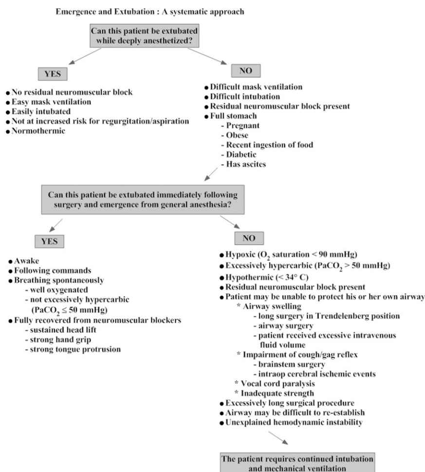
Fig 1 An approach to extubation 14.